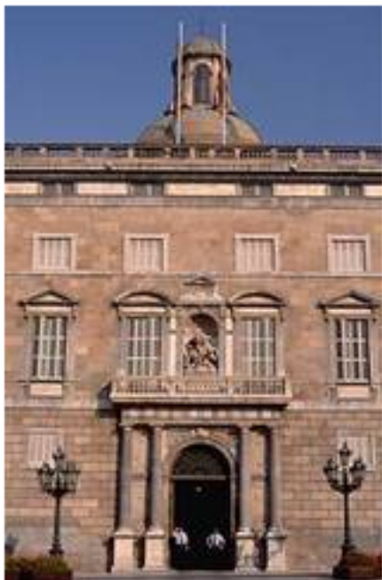
Palau de la Generalitat, Barcelona, Spain

The Girona Manifesto on Linguistic Rights will be presented at the Palau de la Generalitat in Barcelona, the city where the idea for the Manifesto was born, at the World Conference on Linguistic Rights in 1996. Developed by the translation and Linguistic Rights Committee, the Girona Manifesto is a ten point document designed to be translated and disseminated widely as a tool to defend linguistic diversity around the world. At PEN International's 77th annual Congress the PEN General Assembly approved the Manifesto. To find out more click here . To read the Girona Manifesto on Linguistic Rights in over forty languages click here .